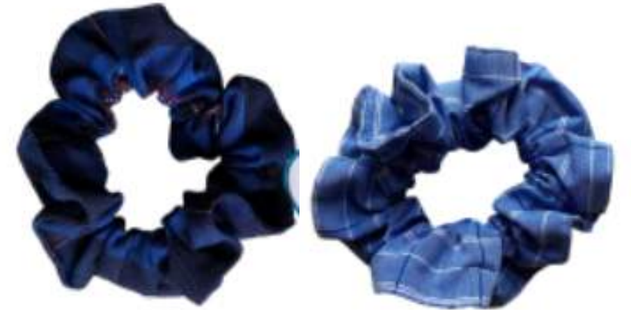
Summer & Winter Scrunchies