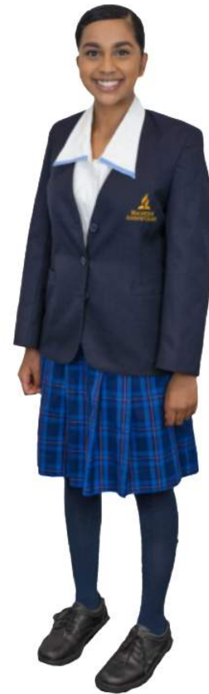
Girls Winter Uniform with Blazer