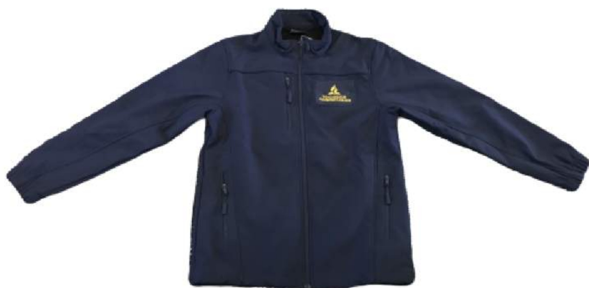
Soft Shell Jacket