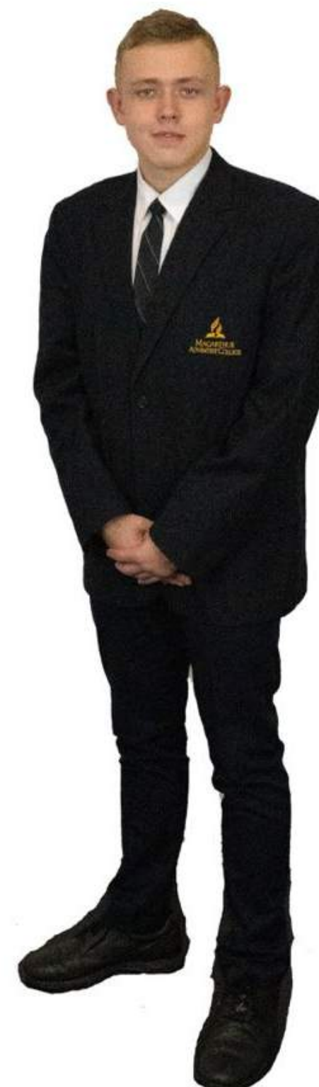
Boys Winter Uniform with Blazer